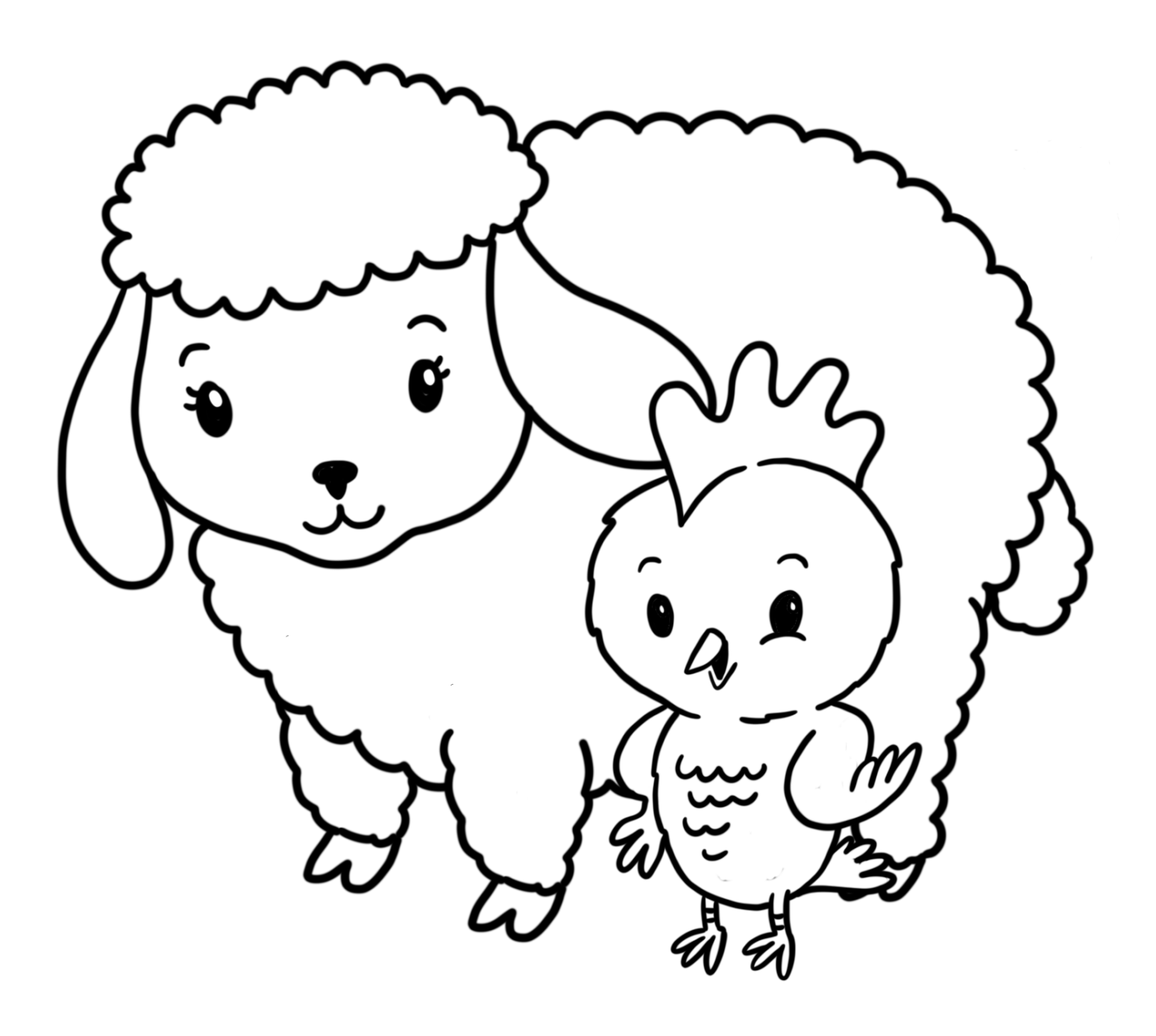
I is for Integrity